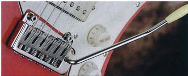
The floating Wilkinson vibrato is a smooth and stable unit that's excellent in use