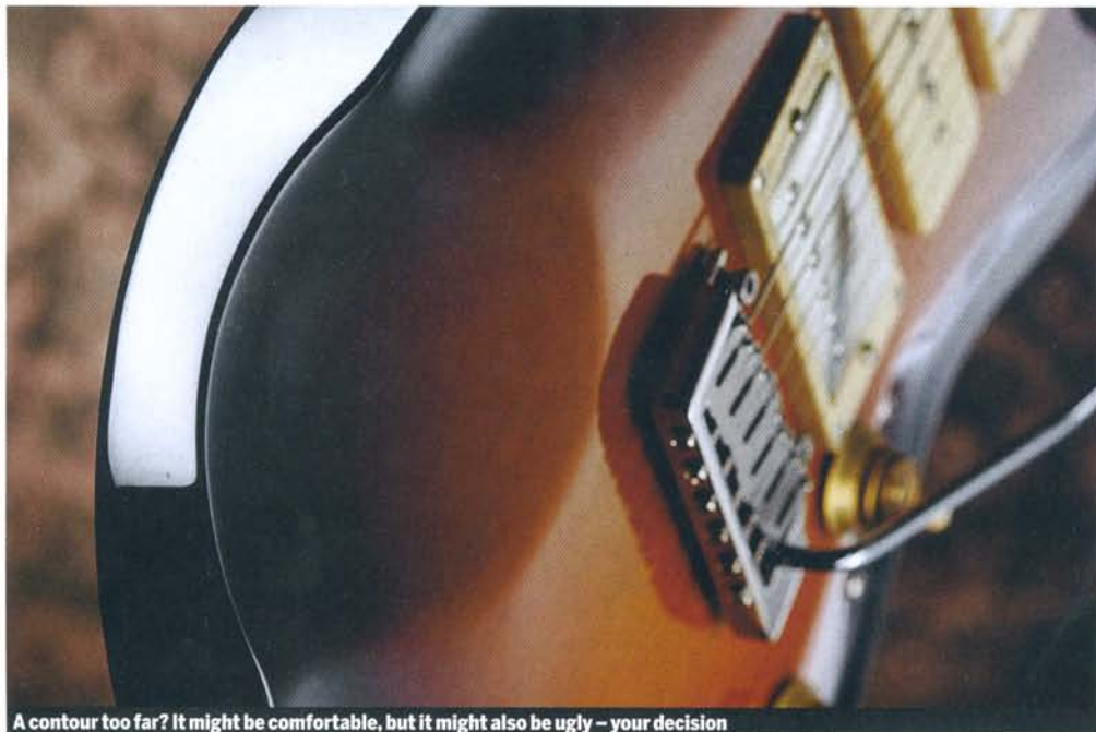
A contour too far? It might be comfortable, but it might also be ugly – your decision

Again the neck is a welcoming platform, with a comparatively nimble and contemporary feel that should appeal to both Fender and Gibson player camps with, like the Ventura, the same 22-fret Indian rosewood 'board, Fender scale-